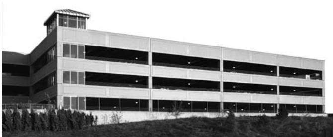
Westage Medical Building Poughkeepsie, NY

These types of healthcare settings reflect the need to accommodate the growing shift from inpatient to outpatient services. Today's healthcare leaders seek affordable and efficient solutions to meet rising consumer expectations for service, quality and access to leading edge medical technology.