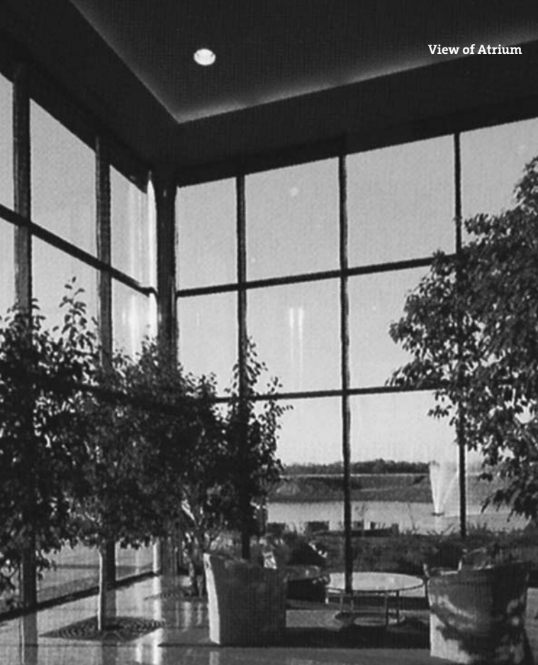
View of Atrium