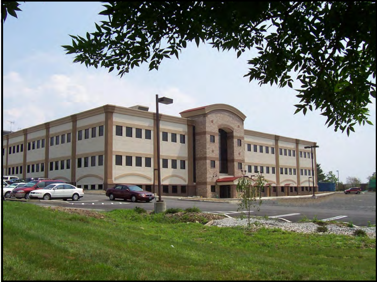
Westage Pavilion 75 Crystal Run Road Middletown, New York